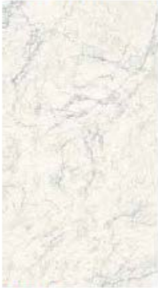
80NA20R NA20 Carrara Rect. 24"x48" . 60x120 cm