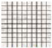
32NA20MO NA20 Carrara Mosaic 1.4"x1.4" . 3x3 cm (sheet 12"x12" . 30x30 cm)