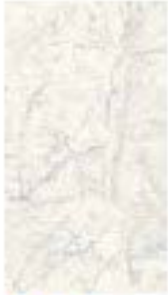
63NA20R NA20 Carrara Rect. 12"x24" . 30x60 cm