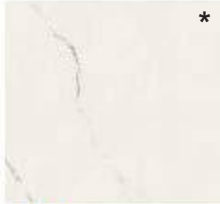
60NA07R NA07 Calacatta Gold Rect. 24"x24" . 60x60 cm