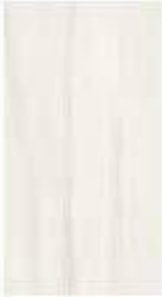
63NA05R NA05 Dolomite Rect. 12"x24" . 30x60 cm