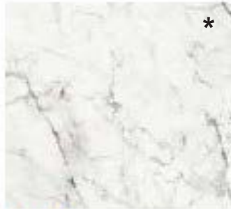
60NA10R NA10 Statuario Bianco Rect. 24"x24" . 60x60 cm