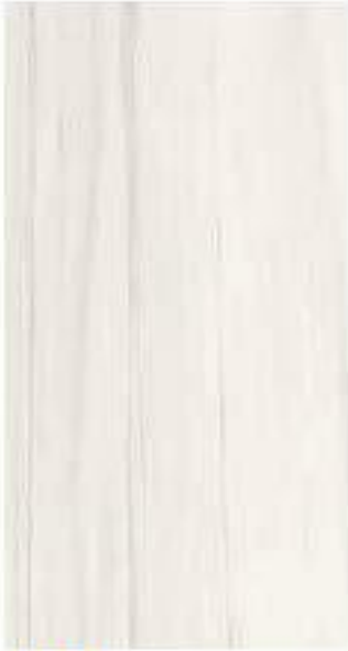
80NA05R NA05 Dolomite Rect. 24"x48" . 60x120 cm