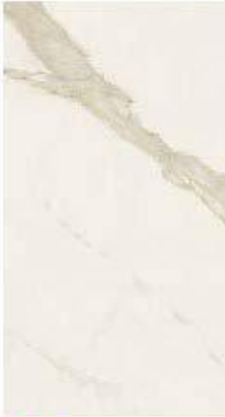
80NA07R NA07 Calacatta Gold Rect. 24"x48" . 60x120 cm