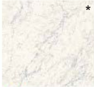
60NA20R NA20 Carrara Rect. 24"x24" . 60x60 cm