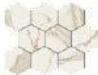
32NA07HEX NA07 Calacatta Gold Hexagon 4"x4" . 10x10 cm (sheet 10"x12" . 26x30 cm)