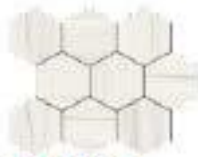
32NA05HEX NA05 Dolomite Hexagon 4"x4" . 10x10 cm (sheet 10"x12" . 26x30 cm)